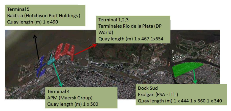
Figure 1: Buenos Aires and Dock Sud Port Terminals plan

Since 1700 different areas bordering Buenos Aires City where used as a port. The later develop of the city was always concentrated here, all the connections to other parts of the country where made by train or wagon from here. Port terminal final design was made by Eng. Luis A. Huergo on the riverbanks of Buenos Aires City and afterwards it was created the terminal in the neighbouring Dock Sud. It is important to mention the first restriction that appears here, the original quay design by Huergo is used nowadays. This consist in a finger piers design that were useful for the cargo vessel, but now for the containers ones brings restrictions to administrate the cranes and the services<sup>2</sup>. Dock Sud port terminal doesn't have this restriction, because it was conceive in a period were the containers vessels exists and it was design with side continuous berths. Although, in returns, a quay of a chemical industry operates in front of it restricting the breath of the vessels that the terminal can attended.