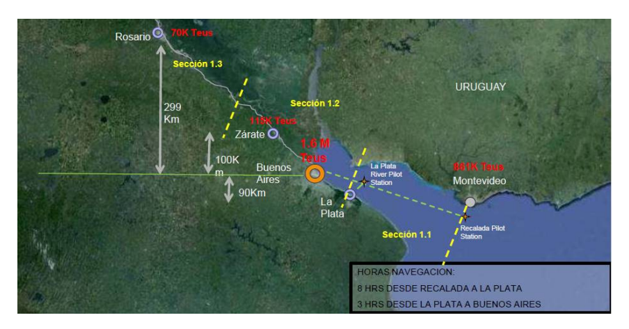
Figure 2: Map of the sections to take trailer and TEUs capacity of the terminals in the zone