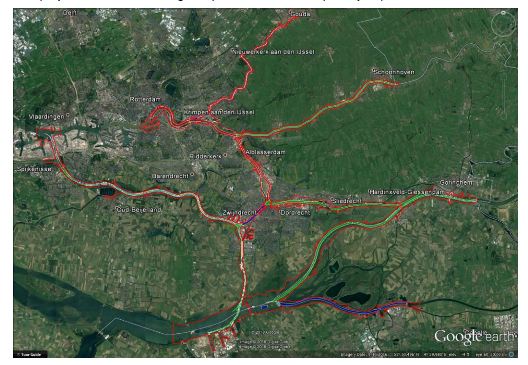
Figure 1: Project boundaries over the river network

In addition to the aspects mentioned above, the current project involves the planning and execution of activities such as dredging, bathymetric survey, rock dumping, soil investigation and retrieval of submerged objects, over a total length of about 160 km of inland waterways. The vastness of the project area as well as the great number of contract areas (200+) each with different specific navigational criteria (bed level, tolerance interval and maximal area of exceedance), feed the need for a simple and clear overview of all key parameters that are relevant for operational management, accurately informing a number of different functions within the project team. On top of this, the multitude of operations require an accurate follow up in order to be able to timely inform the client on the current project status concerning all operational and compliancy aspects.