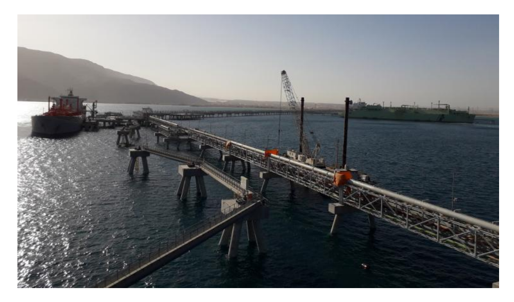
Figure 2: View from Product Berth 2: Product Berth 1 and FSRU berth

The loading platforms are supported on a mixture of vertical piles and raked piles, to resist horizontal loads from fenders. Services platforms are supported on vertical piles.